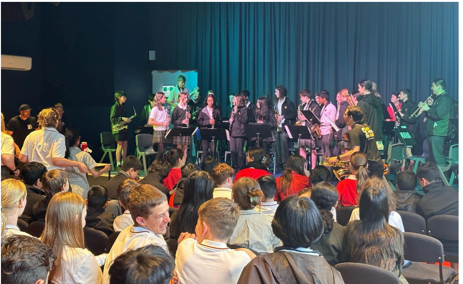
Hot Potato Band incursion, 2023.