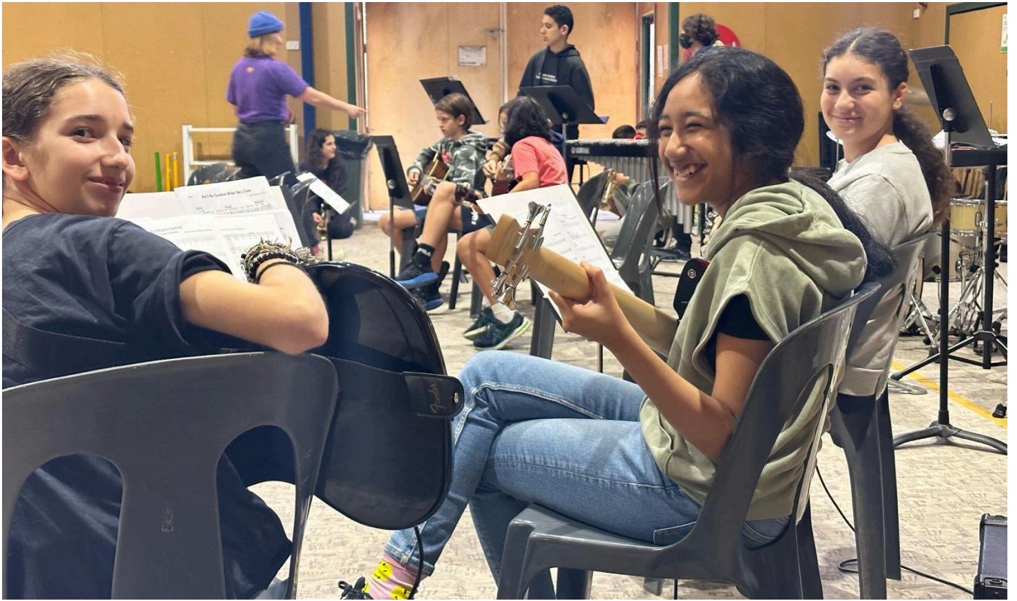
Music Camp rehearsal, 2023.